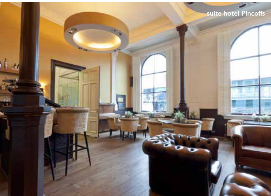
suite hotel Pincoffs

Rotterdam , another five-star hotel, even shares a roof with its own high-end club the hip lounge and cocktail bar HUGH. Room Mate Bruno has the covered stalls of the Foodhallen in its own backyard – a place where you'll find so many appealing options, you may need to extend your stay by a few nights.